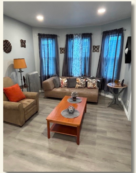
The Dorm 2 Living Room